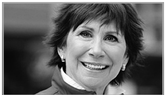
ROCHELLE LASH COUNTRY ROADS

The soignée Inn by the Sea on the Atlantic Ocean outside of Portland, Maine, has two personalities. It has the soul of a simple seaside hotel and the elements of a sophisticated boutique resort.