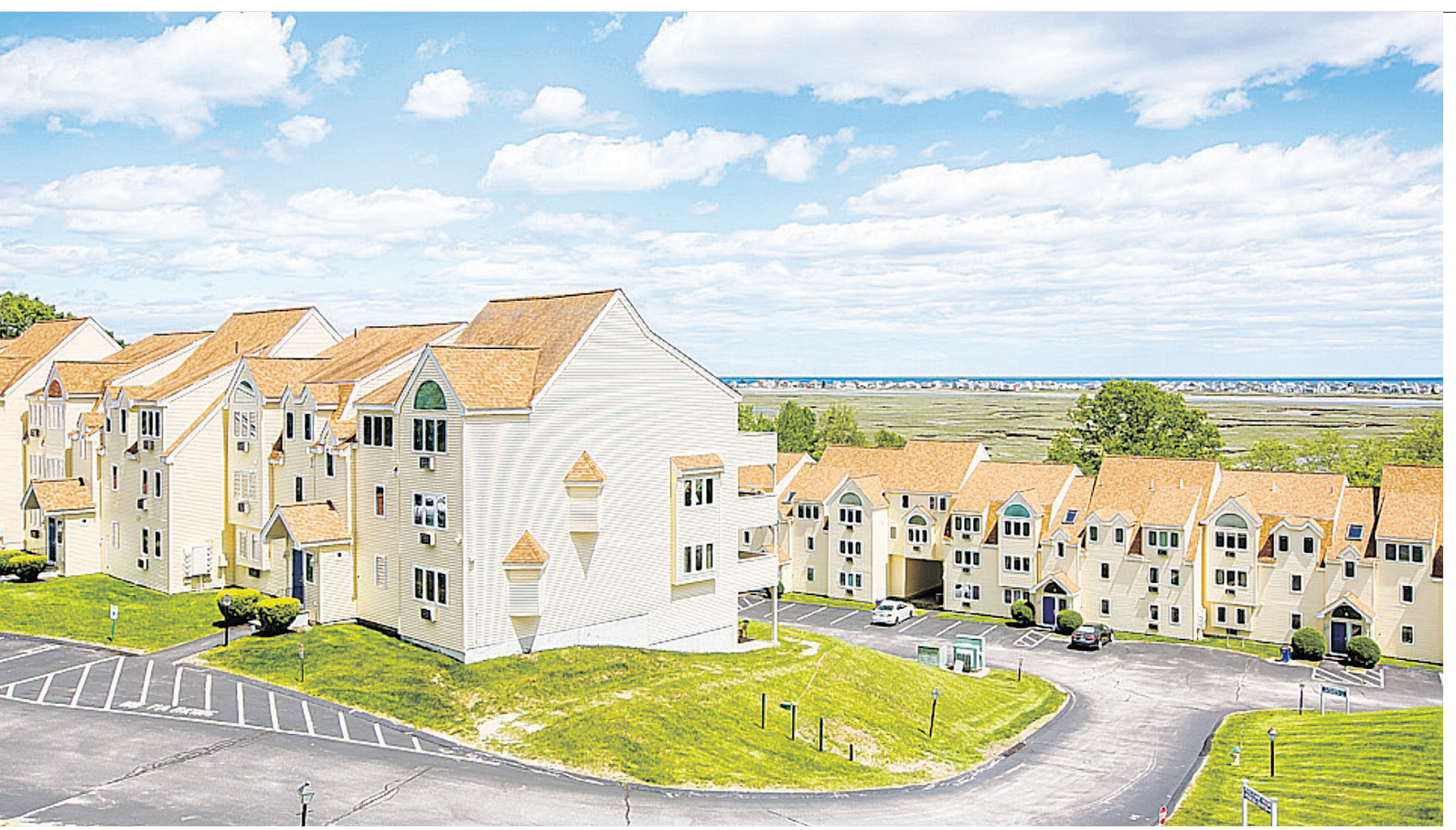
Village by the Sea is a resort in Wells, Maine, that offers a Not Quite Par — But Close! discount for Canadians.