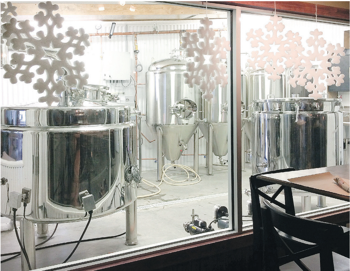
The new microbrewery at Hôtel Roquemont produces five kinds of beer.

Le Roquemont is a country-contemporary brasserie with red leather booths and sturdy tavern chairs, a huge stone fireplace for après-snow sports and pine log walls festooned with vintage snowshoes and fishing gear. It's a sprawling restaurant, split into a family-friendly area and a bar-lounge that hosts live music Thursdays and Fridays after 7 p.m. Food specials and brews on tap are announced on chalkboards, and pro sports dominate the large-screen TVs.