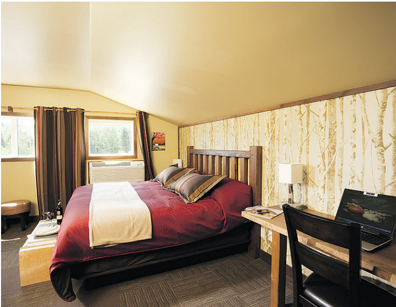
The Panache Suite is one of the top rooms at the updated Hôtel Roquemont in St-Raymond-de-Portneuf.

Le Roquemont is busy-busy, for breakfast, lunch and dinner, because it has an enormous menu for almost everyone: charcuterie, tartares, salads, veggie burgers and kids' stuff, plus creative poutines with boar sausage or smoked salmon and cream cheese. Main courses range from classic pub fare — burgers, spaghetti, smoked meat — to more worldly dishes, such as Thai shrimp, foie gras and duck confit. Beer is brewed on the spot and figures into Le Roquemont specialties such as onion soup