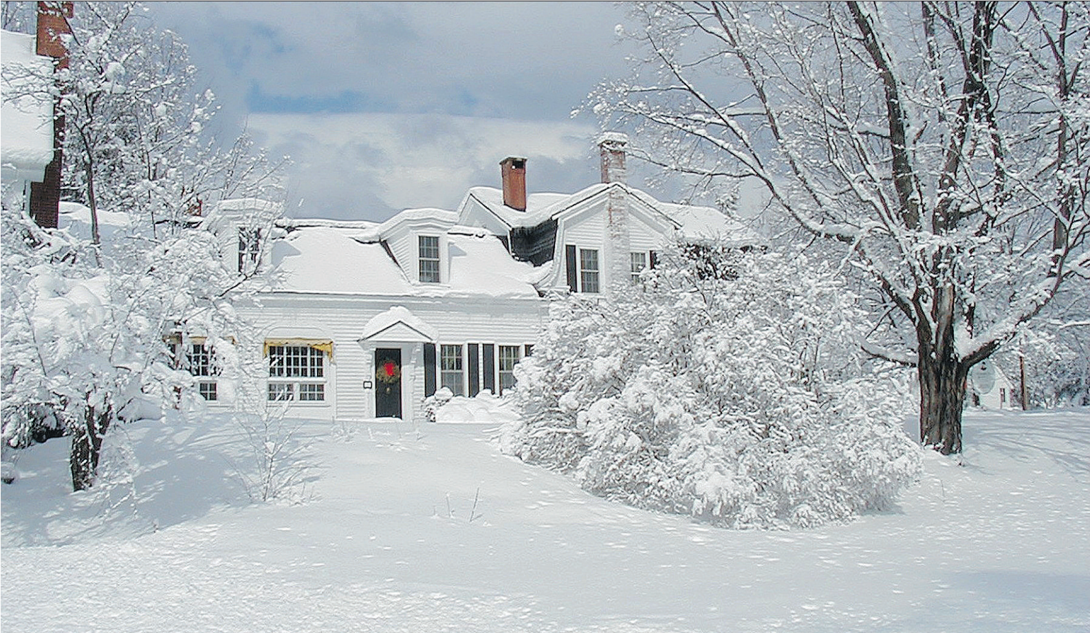
The Admiral Peary Inn in Fryeburg, Maine is romantic and dog-friendly.