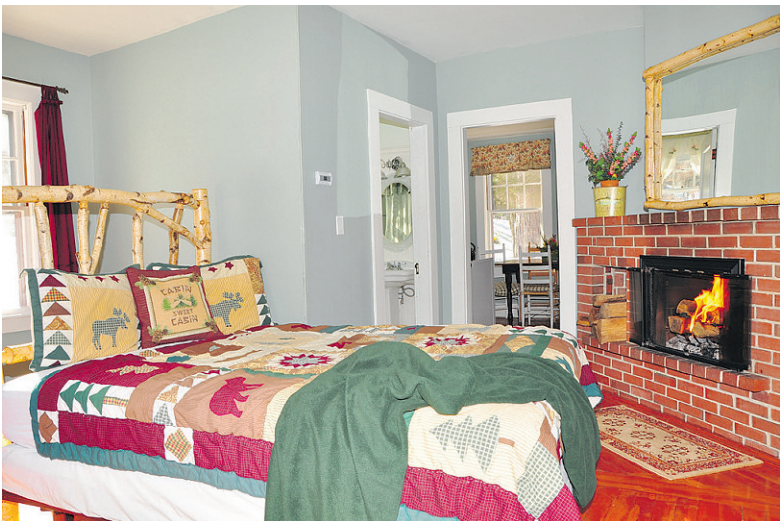
The Bartlett Inn in New Hampshire has history, warmth and a wide range of room styles.