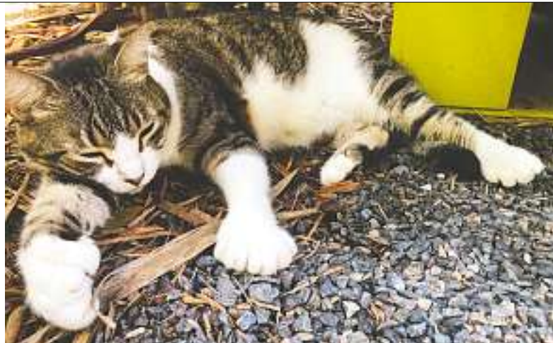
Billie Holiday is one of the six-toed cats at the Ernest Hemingway Home and Museum in Key West, Fla., where the American writer lived in the 1930s with his wife Pauline.

Hoteliers in Mexico are offering free vacations for the next 20 years in a pandemic-inspired contest aiming at reversing a 60 per cent drop in foreign visitors. Industry leaders in the state of Quintana Roo said the winners