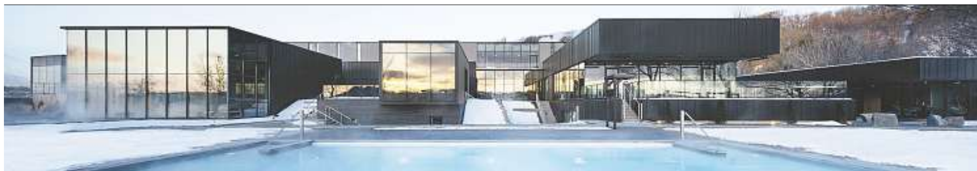
The Nordic sanctuary Strøm Spa boasts a contemporary design from the LemayMichaud firm. ADRIEN WILLIAMS