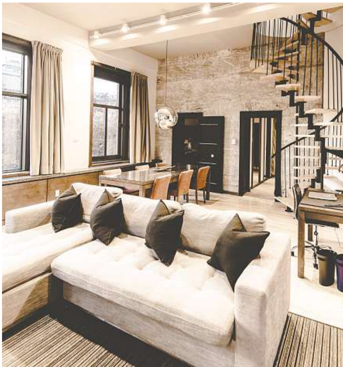
Living large in the penthouse suite at Hôtel 71 in Quebec City. STEFAN THURAIRATNAM

The neighbourhood: Hôtel 71 is at the heart of Quebec City's oldest quarter, near several landmark attractions: Place