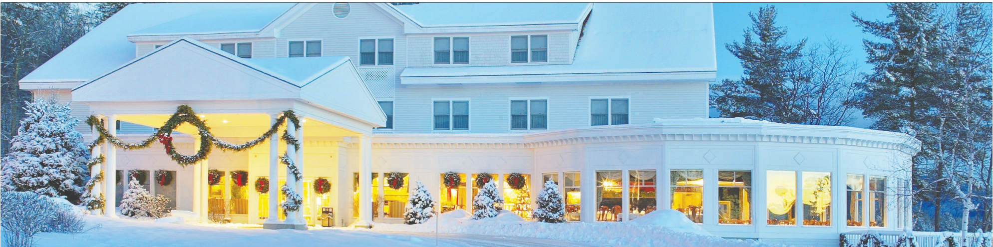
White Mountain Hotel & Resort in New Hampshire is among the properties in the state reaching out to Canadians with discounts on visits. WHITE MOUNTAIN HOTEL & RESORT