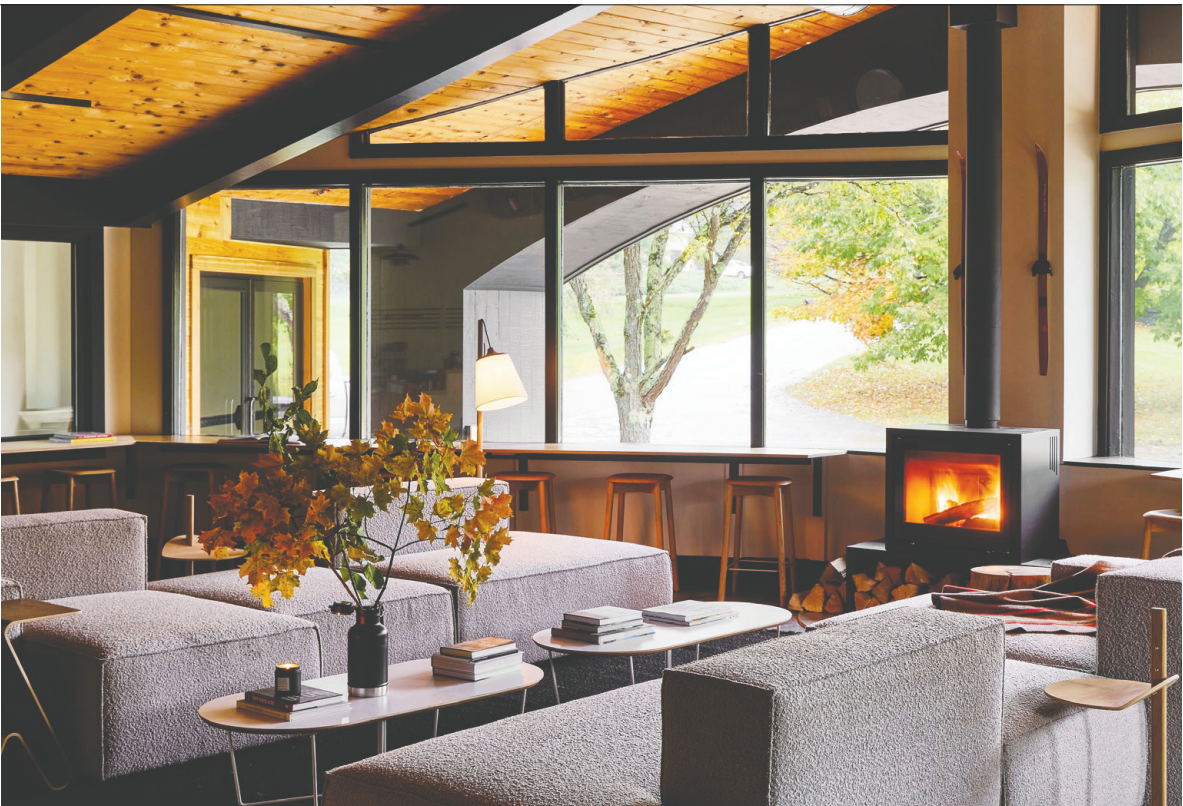
The Tälta is an updated, vintage motor lodge with cool, casual interiors and tranquil riverfront grounds.