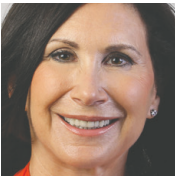
ROCHELLE LASH Hotel Intel

Pure and simple, cool and casual. The new Tälta Lodge in Stowe, Vt., delivers the basics, like beds and beer, in a refreshing, modern overhaul of a vintage motor lodge.