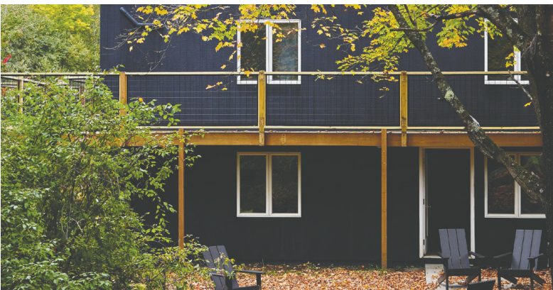
Tälta Lodge is between Stowe's Mountain Road and the Little River.

bles as a fireplace lounge and the front desk sells beer, cider, wine, Bloody Marys and mimosas. A second lounge on the lower level has a microwave and tables, so guests can warm up takeout meals and kids can have snacks.