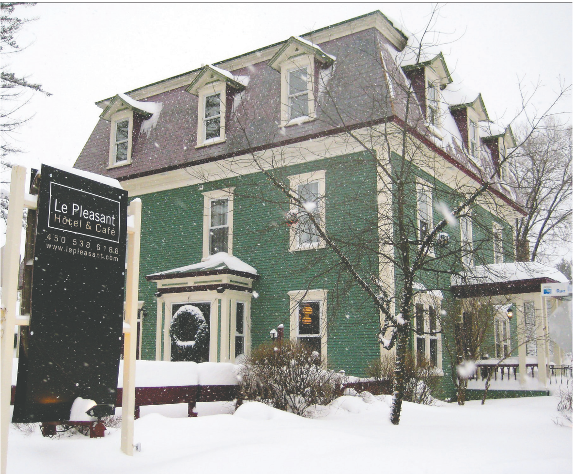
Le Pleasant Hôtel & Café features contemporary comforts and Victorian charm. LE PLEASANT HÔTEL & CAFÉ

beautiful village." She is a woman of taste who wants her guests to have the best of everything. Le Pleasant features B&B and more Bs: bed, breakfast, brunch